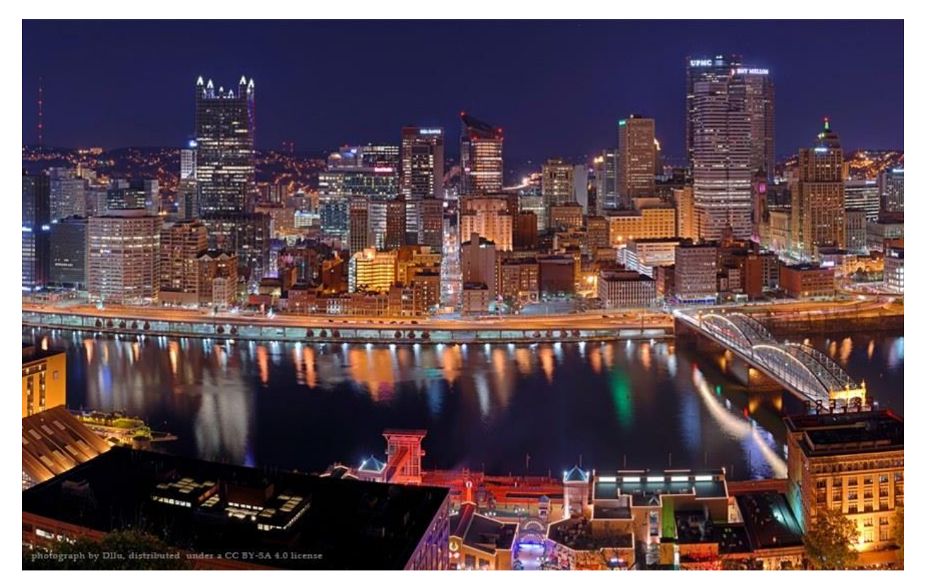
Last Chance to Register for the Drexel Urban Health Summer Institute

There is limited time left to register for the Urban Health Summer Institute taking place June 21 - June 28, 2021. Register by 11:59 p.m. on Tuesday, June 1st to secure your spot! Eight courses are being offered, all teaching practical, tangible skills for participants at all career levels.